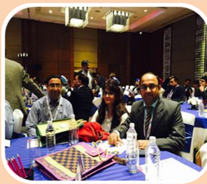
Summits / Conferences