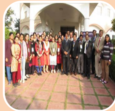
Faculty Development Programs