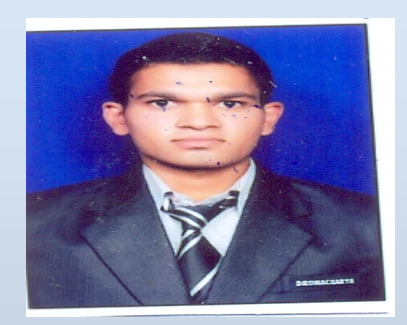
Team1: Reality Mining

Two teams have been shortlisted for TATA First dot powered by NEN and they have been selected as one of India's most promising student entrepreneurs, and are invited to attend the TATA First Dot powered by NEN Boot camps.