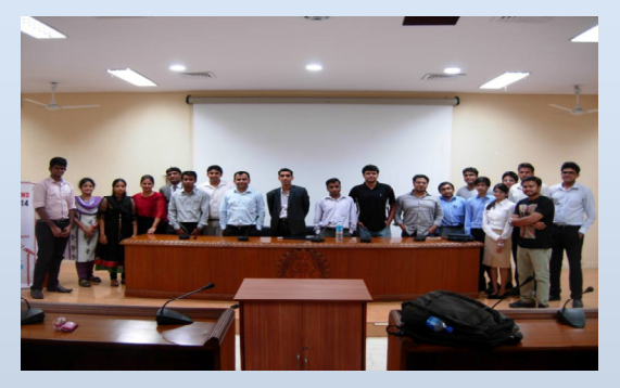
Participants at India's Best Brain Contest