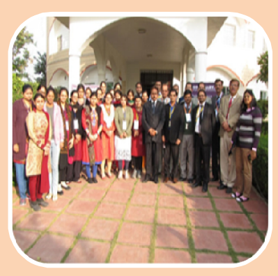
Faculty Development Programs