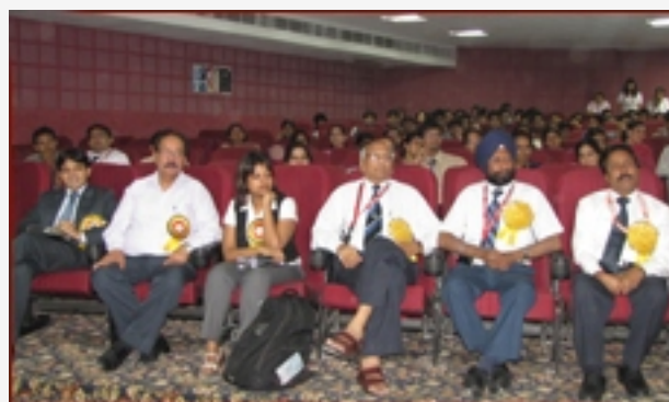
Respected Dignitaries attending the Conclave