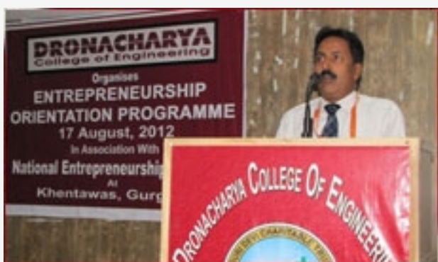
Hon'ble Principal motivating the participants