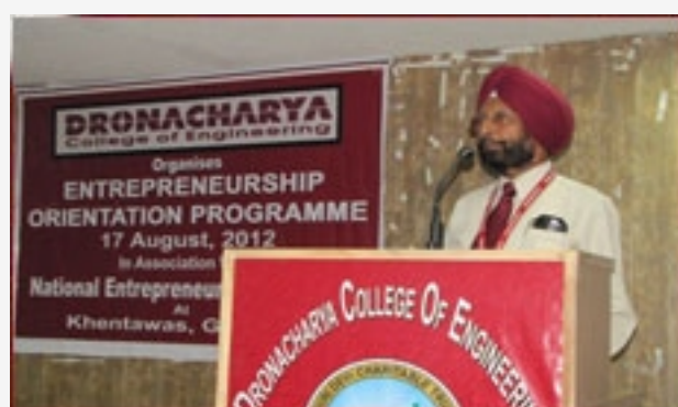
Dean Academics addressing the students