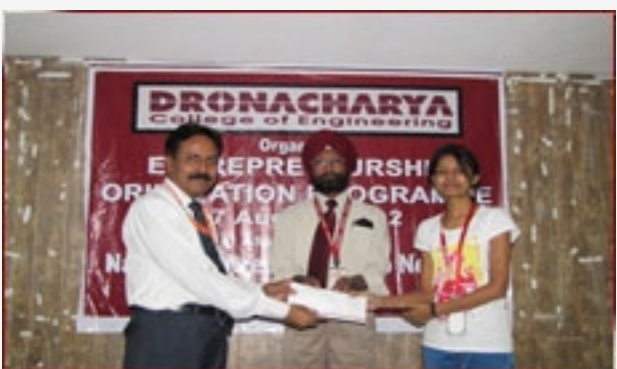
First prize winner of Idea generation exercise