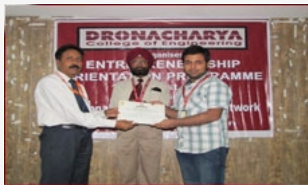
An active participant receiving the certificate