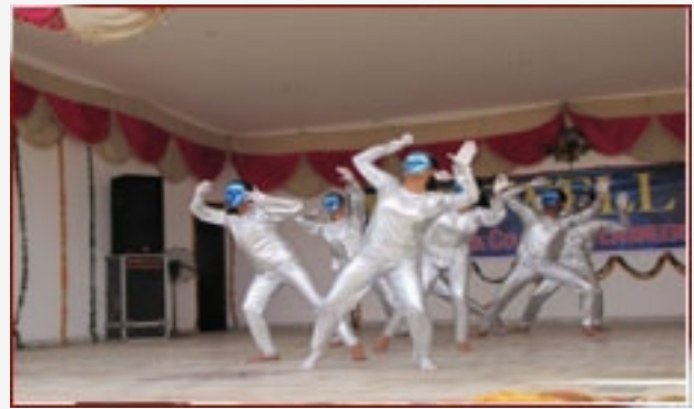
Rocking Performance by CSE students