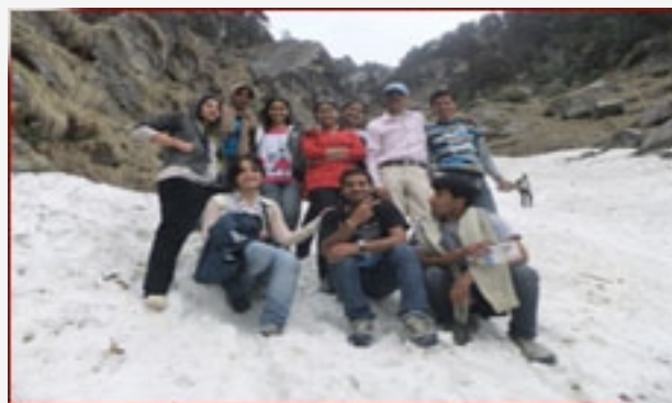
Reached at Trund after 20 km trekking