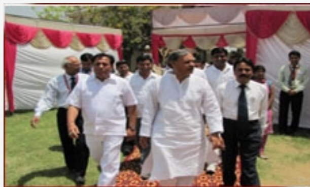
Chief Guest, Shri Rao Inderjit Singh, Member of Parliament, at farewell Function