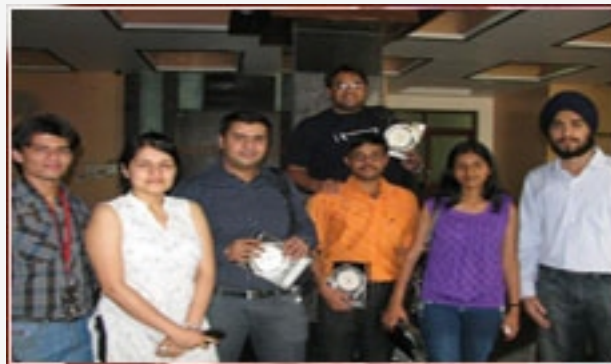
A team of Dream Spark Yatra - 2011