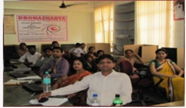
DCE Faculties during Project using Lab VIEW session