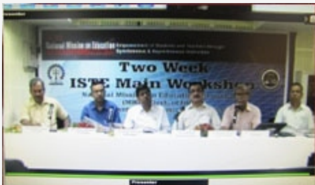
IIT Kharagpur Course Coordinators addressing all Remote Centre Participants on the first day of workshop