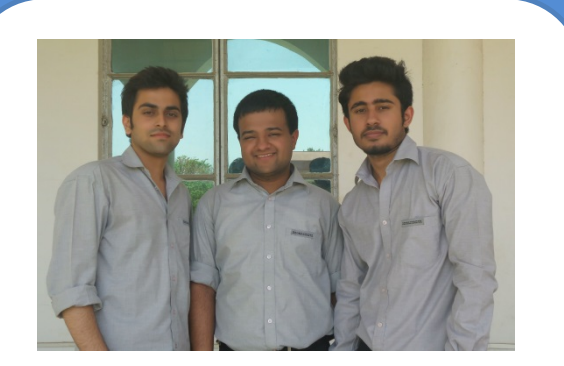
Participating students in Geek'A'Holic

3 day workshop Geek'a'Holic - Addicted to CODE was organized by Hackaholic IT Services and Samsung developers in association with Stirring minds from 24 to 26 January 2014. 3 students of 6th semester made a mobile application named as Sahyog. The main idea behind the application was to bring the social causes in front of the people so that people can come forward and provide a helping hand in the social causes.