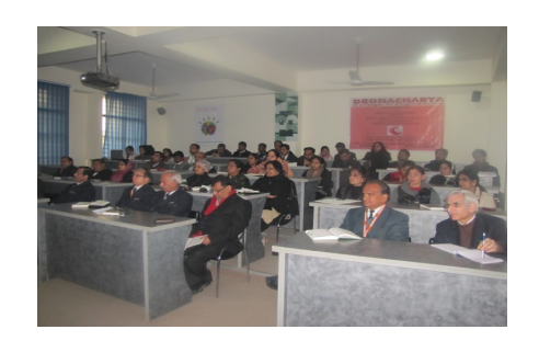
Participants during workshop