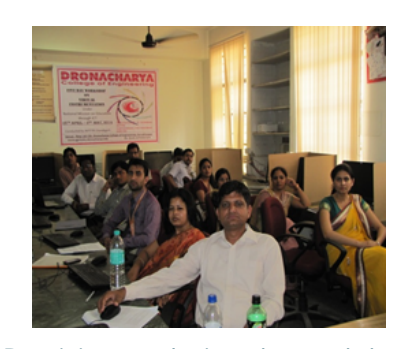
Participants during the workshop