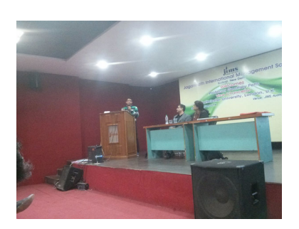
Speaker during the workshop