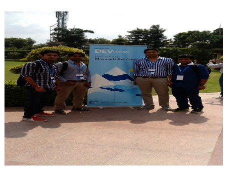
Students at the event

With the upcoming rise in technology the current IT industry is witnessing an upswing in the mobile app development. With an objective of guiding the upcoming developers to build their first app on Microsoft Platform, Microsoft Dev Camp organized a one day camp on 29 August 2013 at Hotel City Park, Gurgaon. 37 students participated in the event.