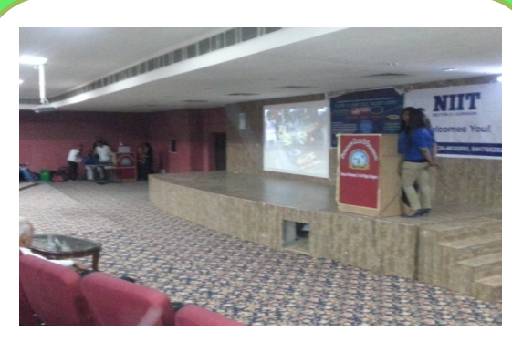
Students at the inauguration event

One day event named Videography and Mobile App Talent Hunt was organized 23 October 2013. The purpose behind this event was to bring the hidden talents of the students by making a video on the social cause and to make the others aware about the same. More over this event provided the platform for the hard core coders to bring the fresh idea about the various mobile applications.