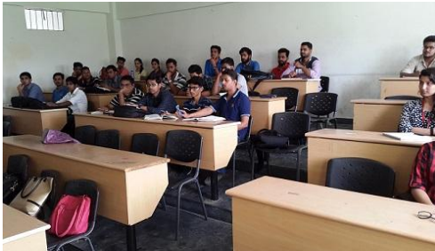
CSE Students attending the online session

A live streaming session “A Special Session on Data Recovery and Backup” was conducted by IBM on 8 th September 2016. Twenty five students of the fifth and seventh semester, from Computer Science & Engineering Department attended the online session. Students learnt about improving backup and disaster recovery through powerful data duplication, protecting data with remote mirroring while optimizing network bandwidth to help reduce costs, protecting data in virtual, physical, cloud and software defined environments as well as core applications and remote facilities, proven and cost-effective cloud disaster recovery solutions that get businesses up and running in minutes.