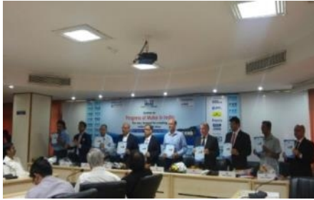
Launch of Make In India Magazine