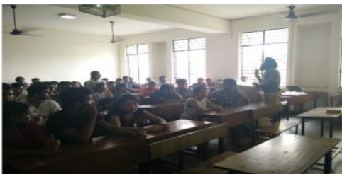
Students of IT department in the session

To boost up the students for performing well in placement process, Department of Computer Science & Engineering organised a Counselling Session by the team of "Quantum of Excellence" on 21 st August 2015 at Dronacharya College of Engineering, Gurgaon. Third and Fourth year students of Computer Science & Engineering and Information Technology departments attended the session. The session was very informative as the students got the overall view to clear the recruitment process and steps that need to be taken care of to get placed in reputed companies.