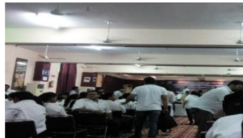
Apprendemos 2015 in progress