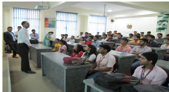
Students taking keen interest during seminar