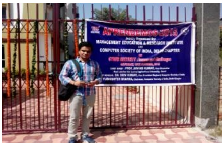
Student of CSE Department at Venue