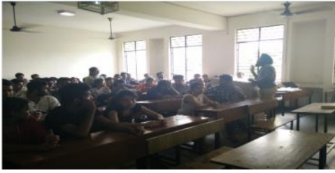
Students of IT department in the session