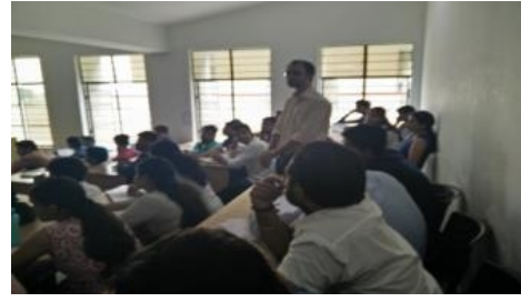
Students of CSE Department raising their