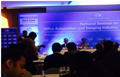
Inaugural Session in progress