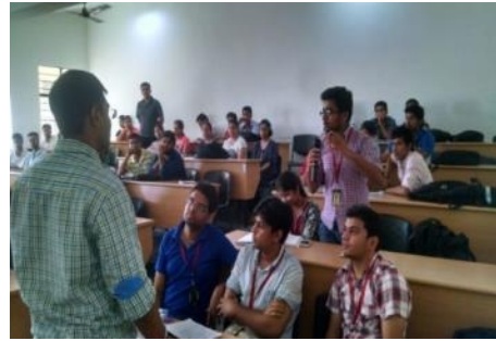
Students of CSE Department clearing their doubts