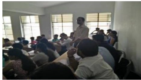
Students of CSE Department raising their