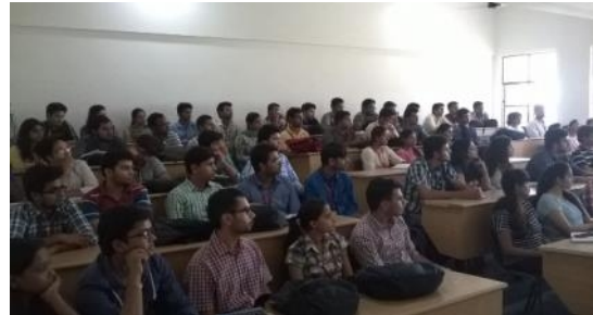
Students attending the seminar